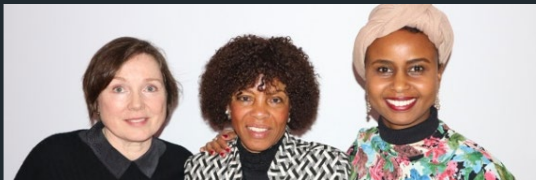
Margaret Busby and Bedford College